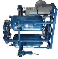
ABP Series Blower Purge 800 - 15,000 scfm