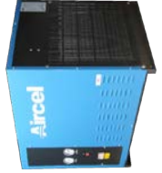
DHT Series High Temperature 20 - 125 scfm