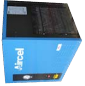
APET Series High Pressure 45 - 1,000 scfm