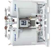
Rental Series Heatless 1,000 - 1,800 scfm