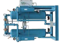
AEHD Series Externally Heated 15 - 3,000 scfm