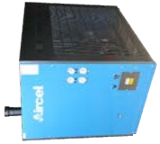
VF Series Non-Cycling Series 10 - 2,000 scfm