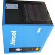
AXP Series High Pressure 45 - 1,000 scfm