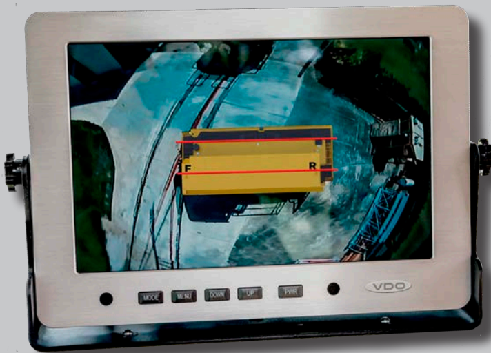
Display screen with operator selected single view.